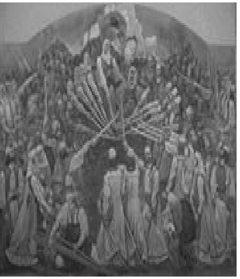
Convention of Dukagjin

he Convention of Dukagjin in the name of the unified regions submitted to the Senate of Venice five chapters on the basis of which Albanians would declare their readiness to cooperate with the Republic in order to banish the Ottoman Empire from their lands.